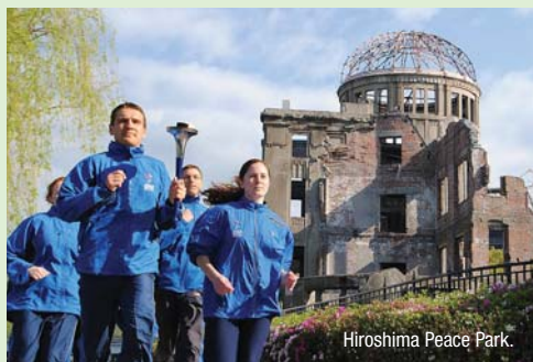
Hiroshima Peace Park.

The Run visits renowned heritage and cultural sites, many recognized by UNESCO, to encourage people to experience the values and culture of others.