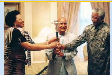
Nelson Mandela, former President of South Africa , and his wife Mama Graça Machel with Sri Chinmoy.