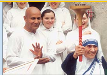
Mother Teresa and Sri Chinmoy celebrate the spirit of harmony.