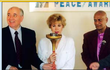
Former Soviet President Mikhail Gorbachev holds the torch with Raisa Maximovna as Sri Chinmoy looks on.